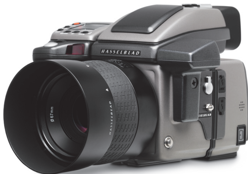
H3DII with the GIL GPS recording device attached.