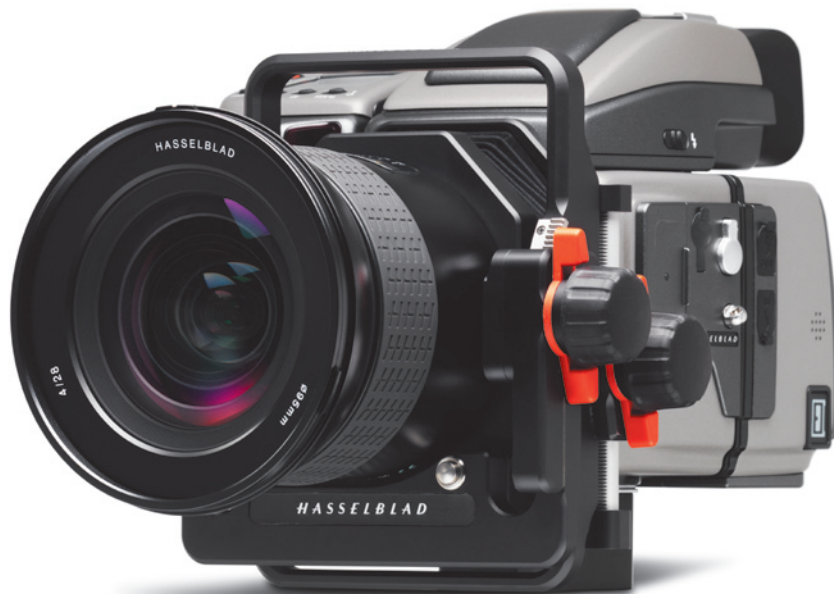
H3DII with HTS 1.5 tilt/shift adapter and a HCD 28mm lens.

To further increase usability, the H3DII-50 has been designed to allow the digital capture unit to be detached and used on a view camera by way of an adapter.